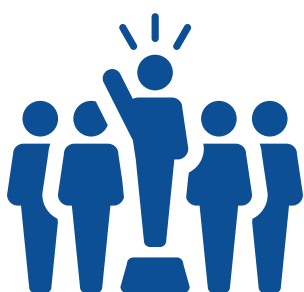
PROGRAM HOSTS & LEADERS